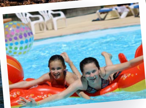
The heated pool