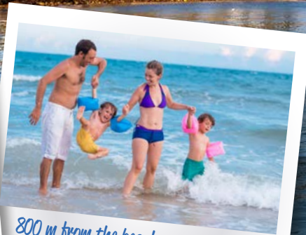
800 m from the beach

Morbihan - Bretagne Sud Tél./Fax : 02 97 41 87 22 www.camping-les-genets.com